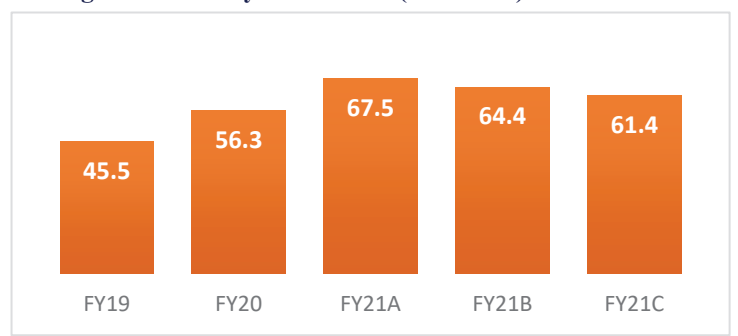
Figure 1: Poverty in Pakistan (in million)

economic recovery. Poverty is projected to have increased from 45 million people in FY19 to 56.3 million people in FY20.<sup>13</sup> The projected poverty for FY21 under the 3 Scenarios (mentioned above) is: