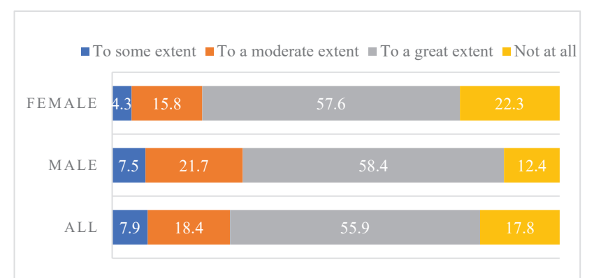
Figure 2: Impact of Shocks on Employment

Employment of both women and men is impacted by a great extent at 56% due to the lockdown during COVID-19.<sup>14</sup> Percentages of this impact are comparable for women and men (57.6% for women; 58.4% for men) (Figure 2).